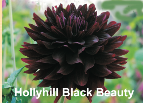
Hollyhill Black Beauty

We will be hosting the Pacific Northwest Dahlia Conference Show this year September 14 th - 15 th . At this fabulous show we will expect many more