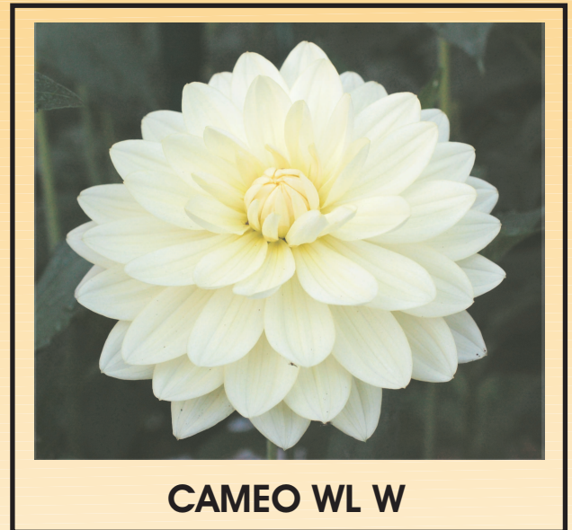
CAMEO WL W

We are about 7 inches of rain below normal for the rain year. I know that we need the rain but I am getting quite tired of it. We only had snow one day here in Roseburg and a light dusting another day so we have been lucky in our winter weather compared to other Northwest areas. It has been a cold winter so we are looking forward to warmer Spring weather.