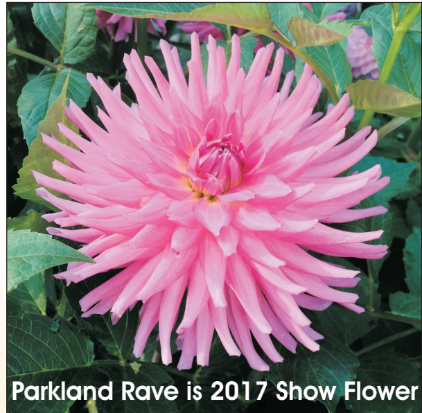
Parkland Rave is 2017 Show Flower

We learned from our first show at Oaks Park last year that parking spaces fill up fast and if you leave the park for lunch, you will likely have trouble finding a space if you return. That being the case, we are