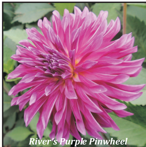
River's Purple Pinwheel

LCDS is committed to participate in the continuing virus research project in 2017. We are pleased with support coming from the national level to follow up on first year samples. This is a great first step to understanding more about the challenges we face.